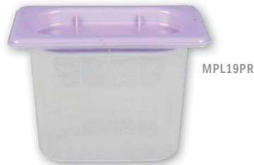
See page 95 for ModPans