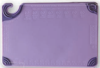
Allergen Saf-T-Zone® Cutting Board CBG121812PR