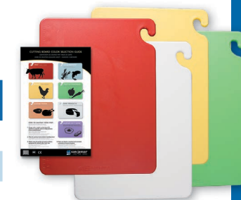
4-Board Cut-N-Carry® System